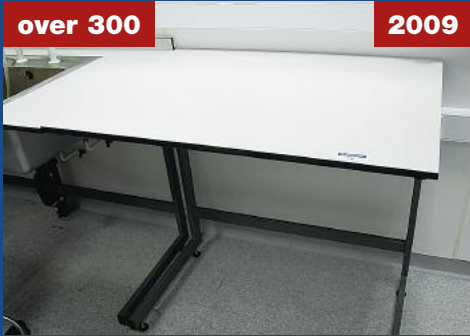
over 300 laboratory benches (2009), over 170 chairs, over 70 laboratory cupboards