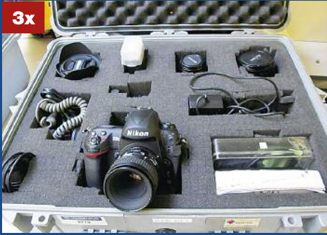
"NIKON" D3X digital cameras