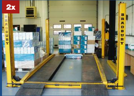
"BRADBURY" vehicle lifts