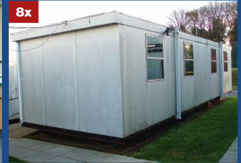
"ELITE SYSTEMS", "ROLLALONG" etc. portable buildings