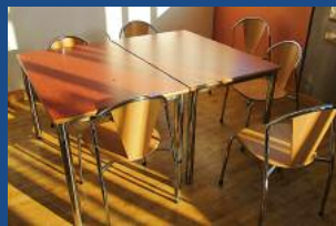
canteen seating sets "ATLAS COPCO" SF4 "BAMBI" DT/23Q air compressors

"BUEHLER" - 4 sample polishers "LECA" - 2 cut off saws "SAMPLE" - 4 mounting presses tyre changing equipment, trolley jacks engine crane, axle stands, etc. "SCHMIDLIN" 4 hydrogen generators CF nitrogen generator "HYDROVANE" HV07RS - air compressor 2 coffee machines 145 printer toner cartridges (unused) without illustration