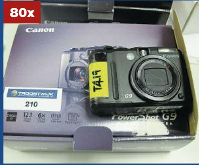
"NIKON", "CANON" & "SONY" digital cameras

"SINAR" → 5" x 4" plate camera with 22 Mpixel digital back flash guns tripods lights lenses photographic accessories without illustration